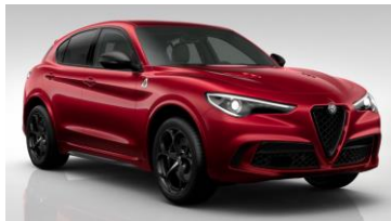
Alfa Red (414)