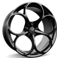
20-in Exclusive Silver alloy wheels (No Runflat)