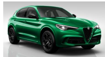
Verde Montreal (398)