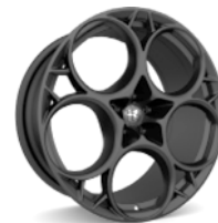
21-in Exclusive Dark Alloy Wheels - (No Runflat)