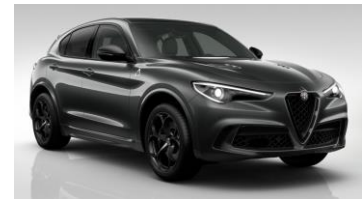
Vesuvio Grey (035)