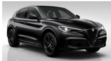
Vulcano Black (408)