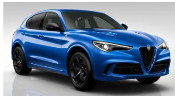
Blue Misano (756)