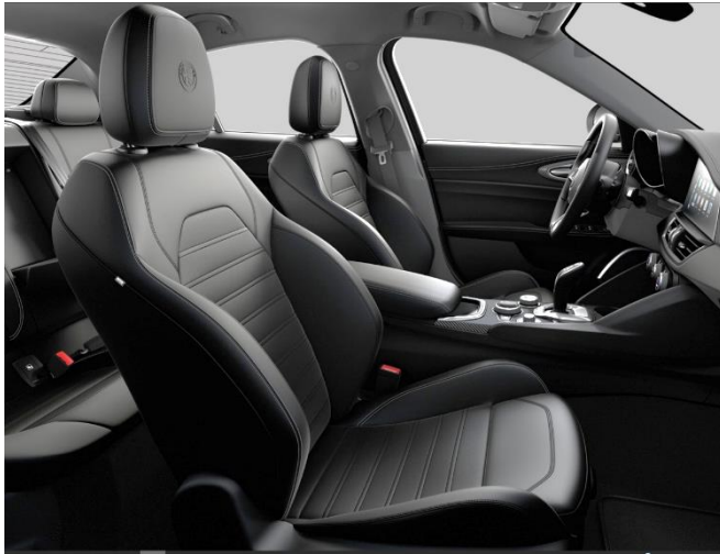
Black Sport Front Seats with Natural Leather (778)