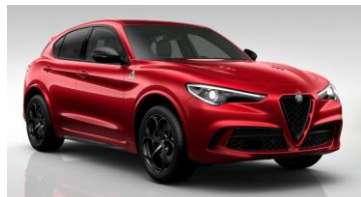
Rosso Etna (645)