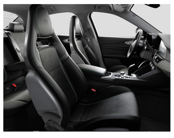
Carbon shell sport seats by Sparco with power adjustable height and white & green stitching – Leather Upholstery combined with Alcantara (890) Optional - Code 60A & 4N5